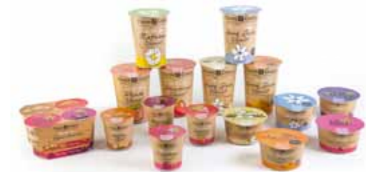
Selection of the wide range of high quality yogurts