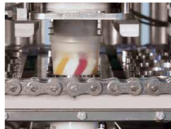
Fascinating filling option with the "swirl" and "side-by-side" technique