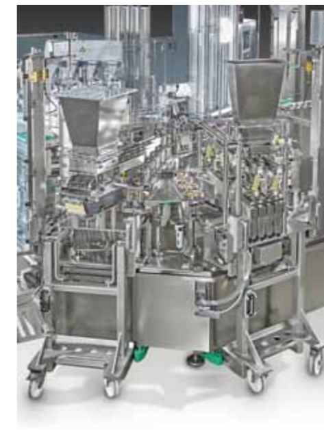
Partial view and overall view of 4-lane filling machine GRUNWALD-ROTARY 20.000

In the case of this dosing machine which was specially developed for this application the amount of hummus to be dosed is pre-selected on the operator panel. The amount then dosed is achieved with accuracy.